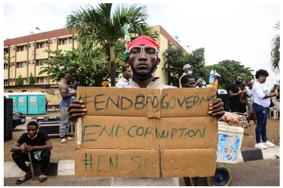
Protesters demonstrate against police brutality in Lagos on October 19, 2020.