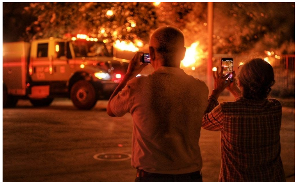
Jeff Frost captured this shot of a couple photographing a California wildfire.