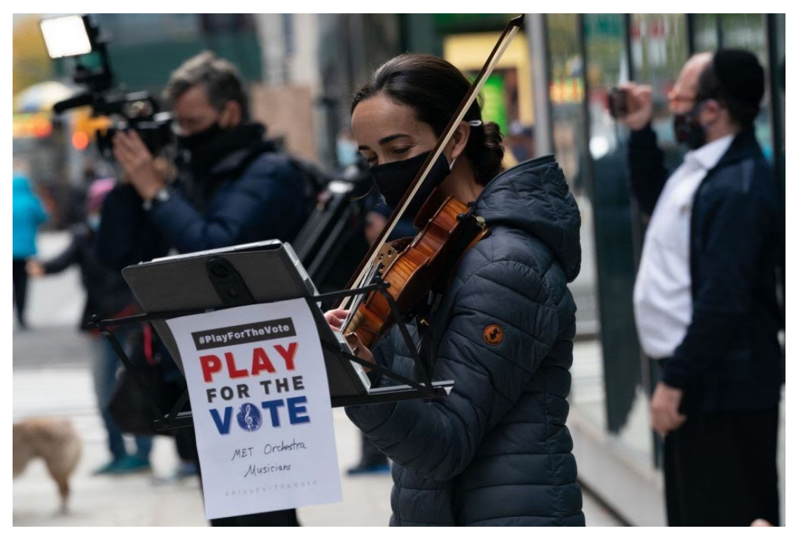
Metropolitan Opera Orchestra musicians perform classical music for Upper West Side voters outside the David Rubenstein Atrium at Lincoln Center on Election Day, November 3, 2020 in New York.