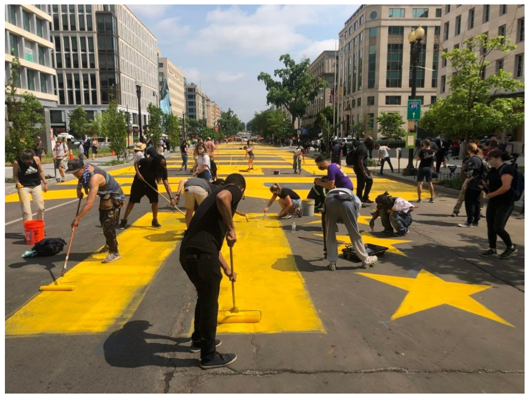
Painters work on a mural on 16th Street in Washington, DC, on June 5, 2020 before the renaming of the street Black Lives Matter Way.

Protesters gather around the statue of Confederate General Robert E. Lee on Monument Avenue on June 6, 2020 in Richmond, Virginia, amidst protests over the death of George Floyd in police custody.