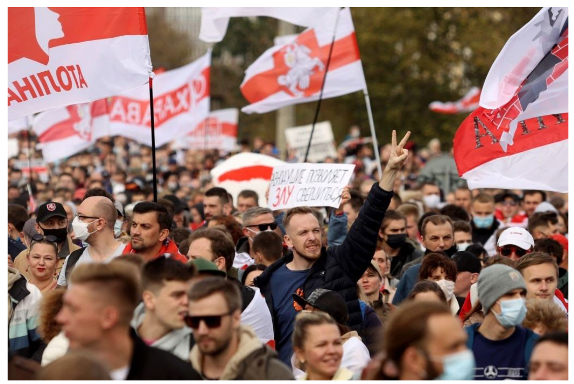
Protesters parade through the streets during a rally demanding the release of jailed activists in Minsk on October 4.