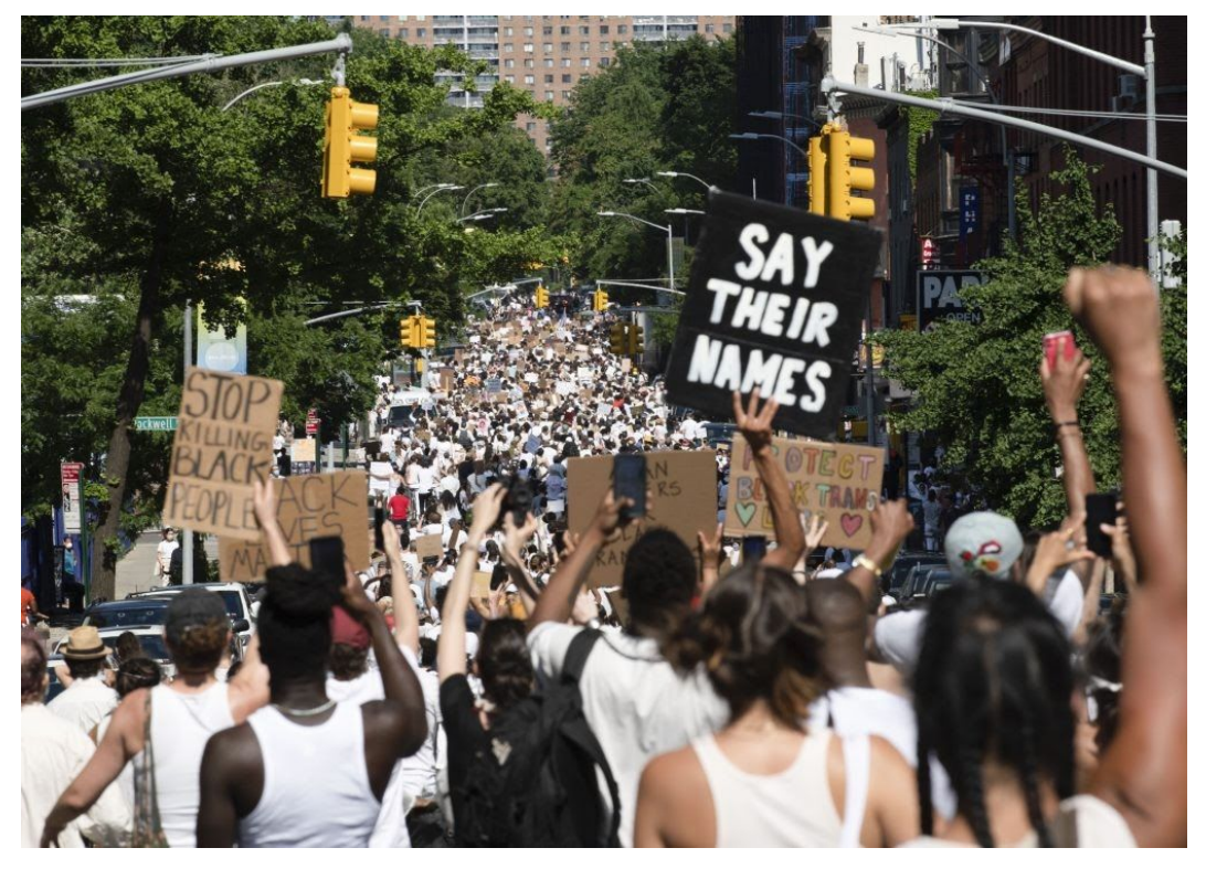
Thousands fill the streets in support of Black Trans Lives Matter and George Floyd in NYC.