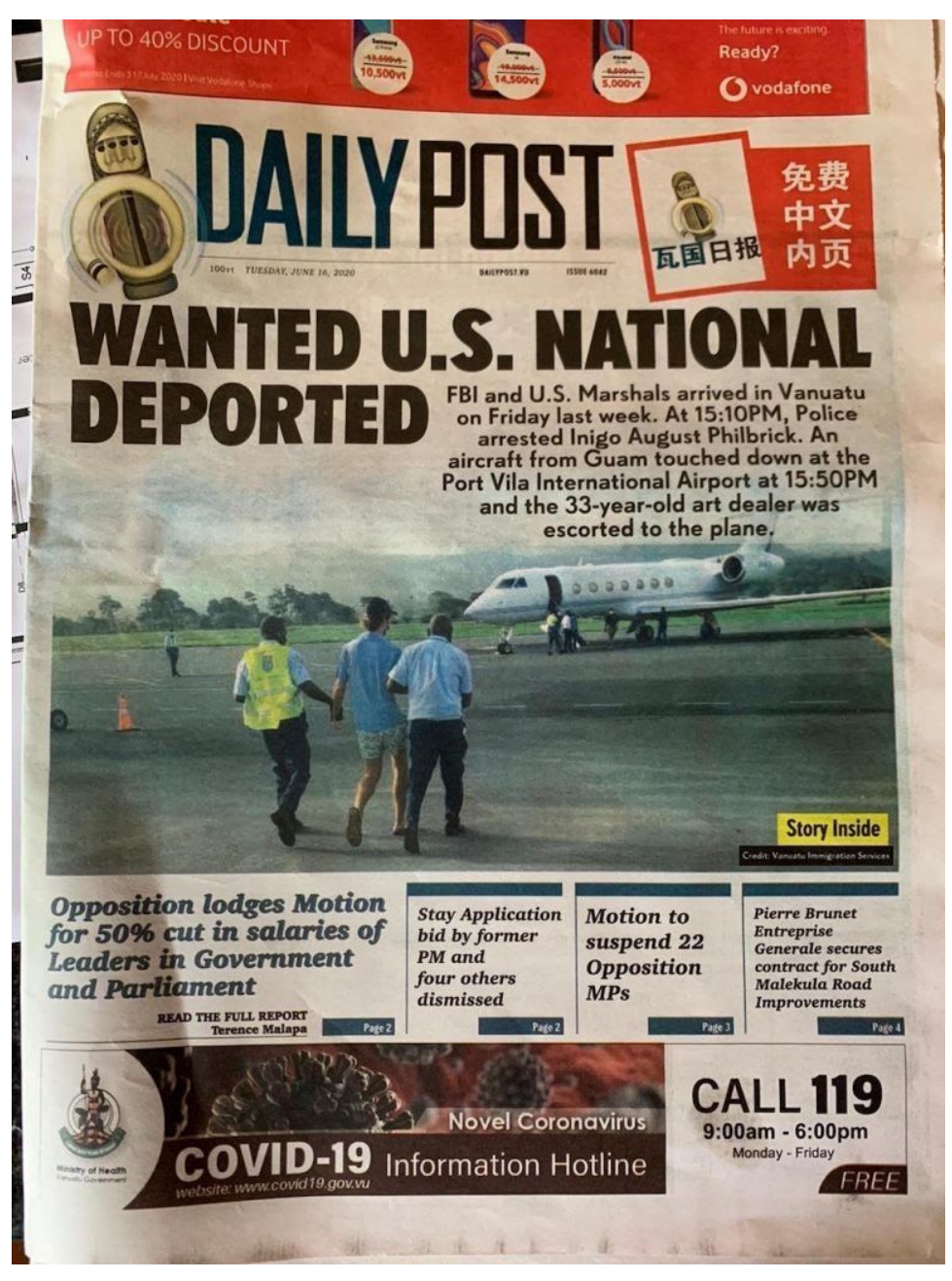
Inigo Philbrick's arrest on the front cover of the Vanuatu newspaper, The Daily Post