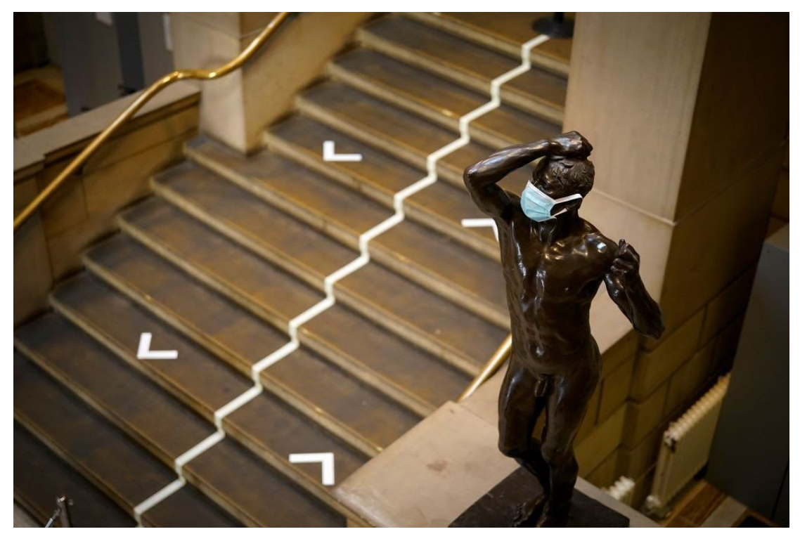
A statue in Manchester Art Gallery.