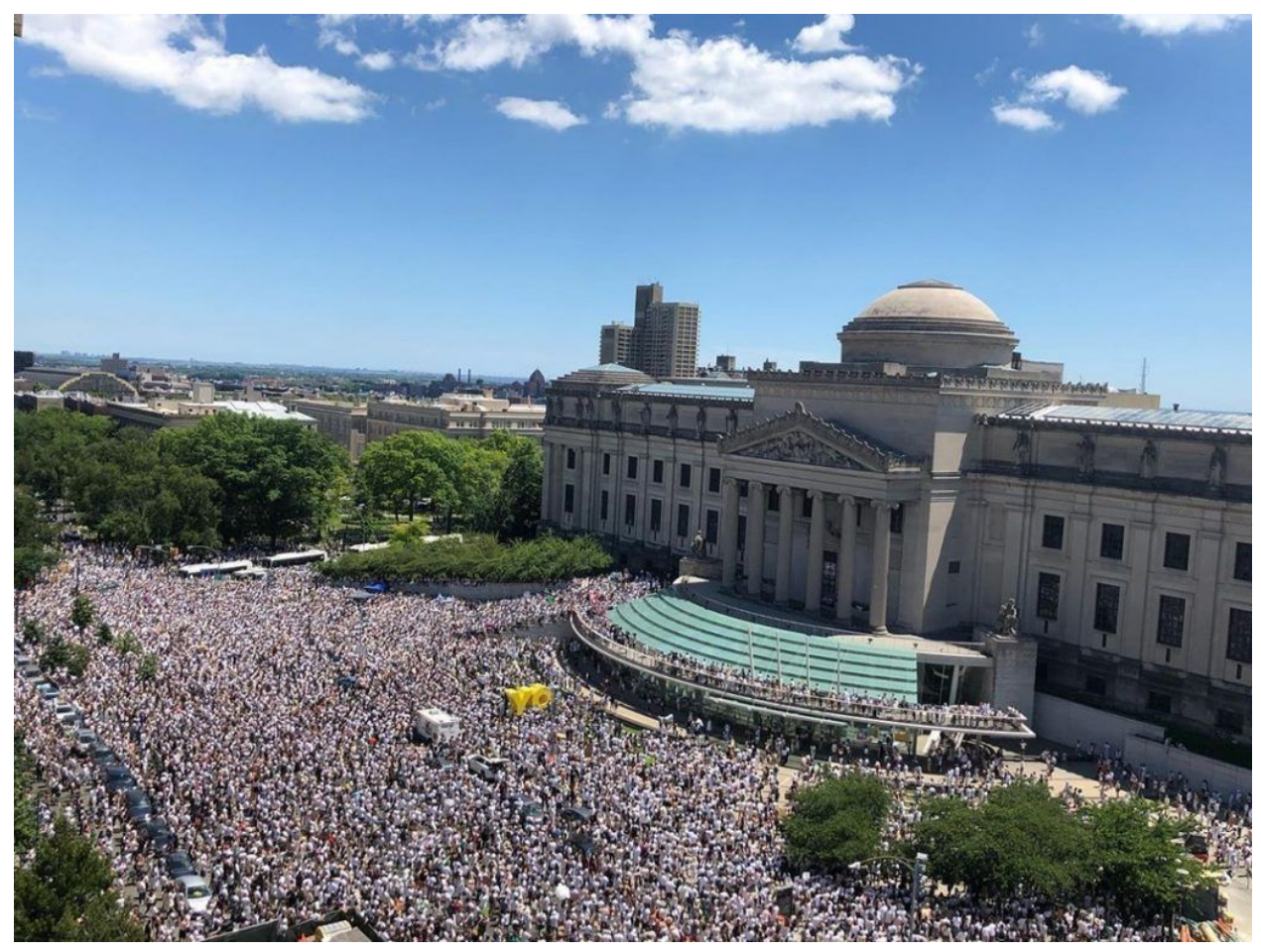
Outside the Brooklyn Museum during the Black Trans Lives Matter March in June 2020.

For a year that is almost impossible to find the words to describe, there are an abundance of images that speak volumes. From Black Lives Matter protests to brazen museum heists, here are some of the most striking photographs of this topsy-turvy 2020.