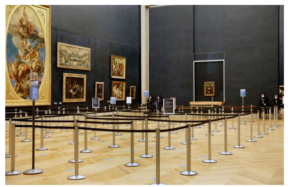
The Louvre Museum.