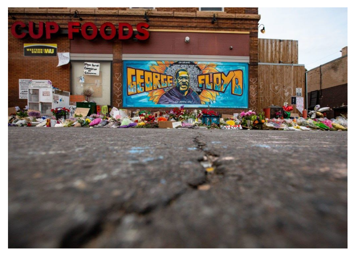
The mural and makeshift memorial outside Cup Foods where George Floyd died in Minneapolis, Minnesota.

The statue of Colston is pushed into the river Avon.