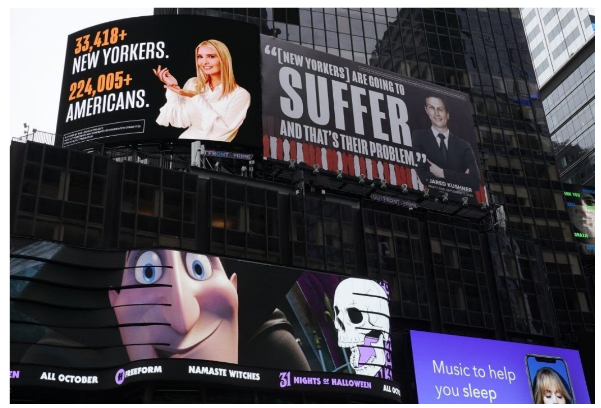
Ivanka Trump presenting the number of New Yorkers and Americans who have died due to Covid-19.