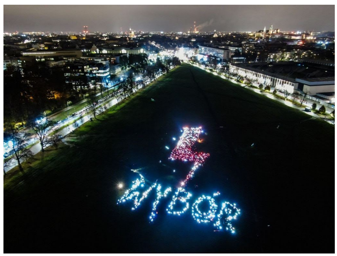
An aerial view of people who gather and light up their smartphones or lanterns to form an inscription saying WYBÓR ("choice" in English) along with a lightning bolt.