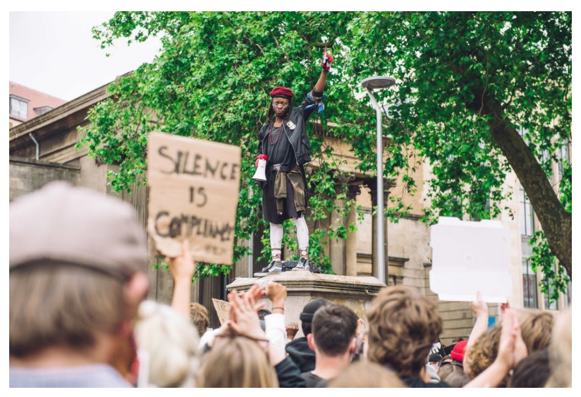
A protester speaks to a crowd from the pedestal that once hosted the statue of Edward Colston.

People hold up flags noting the names of Native American people who have been killed, on the spot where a statue of Christopher Columbus, which was toppled by protesters, stood on the grounds of the State Capitol on June 10, 2020 in St Paul, Minnesota.