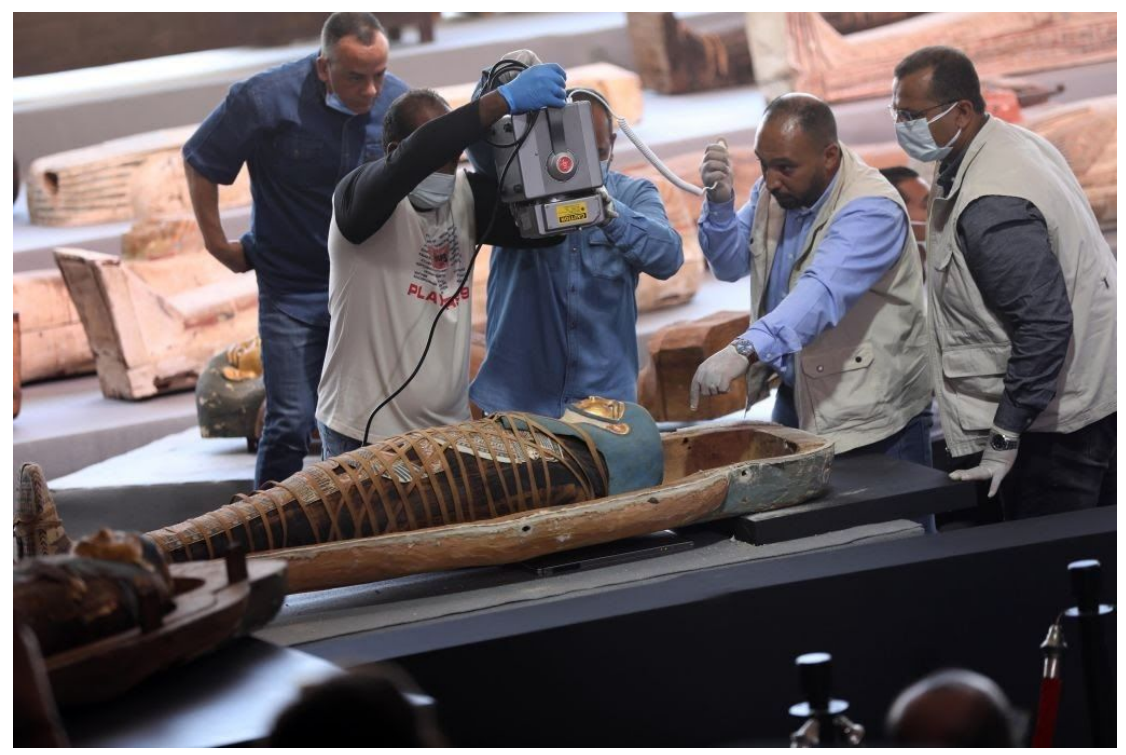
Experts conduct an X-Ray examination for a mummy inside a coffin on the site of the wooden coffin discovery in Giza province, Egypt, on Nov. 14, 2020.