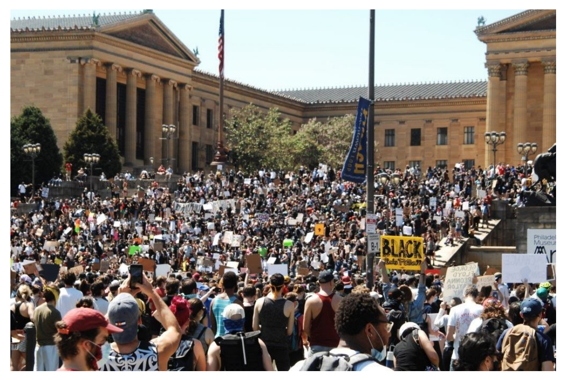
Black Lives Matter, Philly Real Justice, and thousands of Philadelphians rallied on the steps of the Philadelphia Art Museum.

Banksy donated the proceeds of the sale at Sotheby's of a painting triptych, Mediterranean Sea View 2017 , offering commentary on the refugee crisis to a Bethleham hospital.