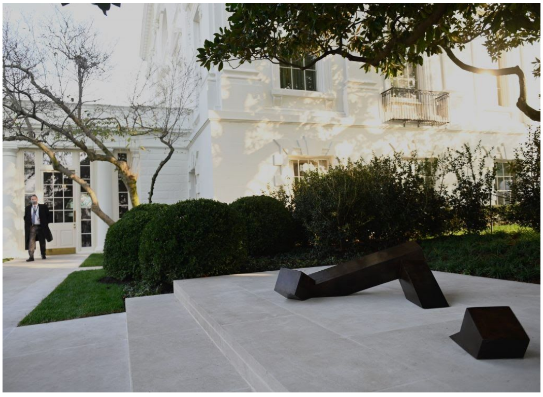
Isamu Noguchi's Floor Frame (1962), is displayed at the White House in Washington, DC, on November 21, 2020.