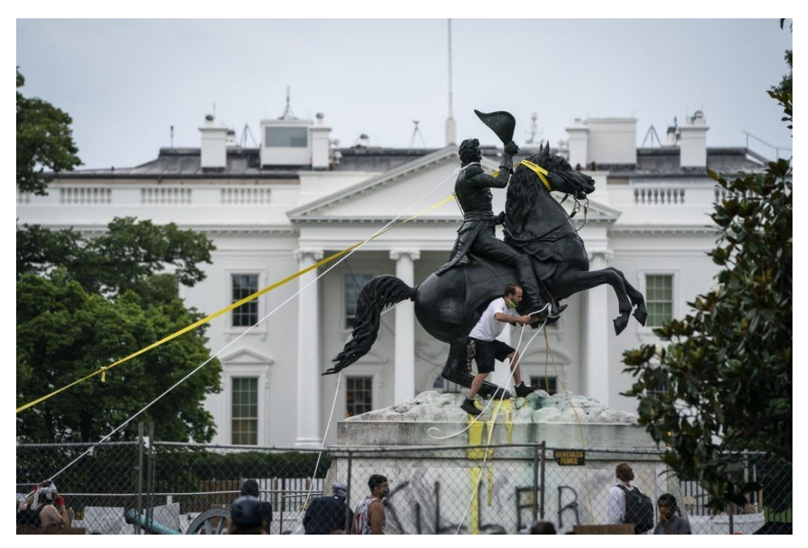
Protesters attempt to pull down the statue of Andrew Jackson in Lafayette Square near the White House on June 22, 2020, in Washington, DC.