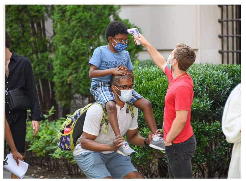
A worker checks the body temperature of a visitor outside The Metropolitan Museum of Art.