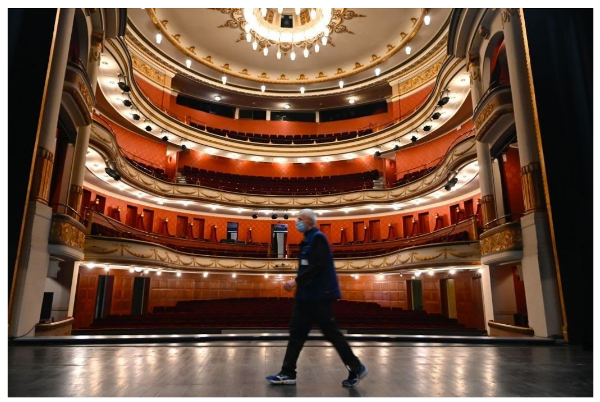
Theatre de la Sinne.