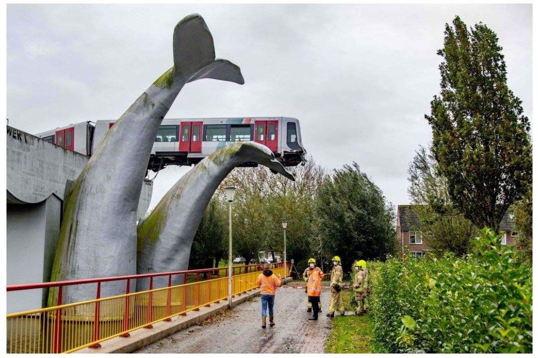
An photo taken in Spijkenisse, on November 2, 2020 shows a metro train that shot through a stop block at De Akkers metro station, without any casualties. It was prevented from plummeting into water by a sculpture of a whale tail called, improbably, Saved by the Whale's Tail .