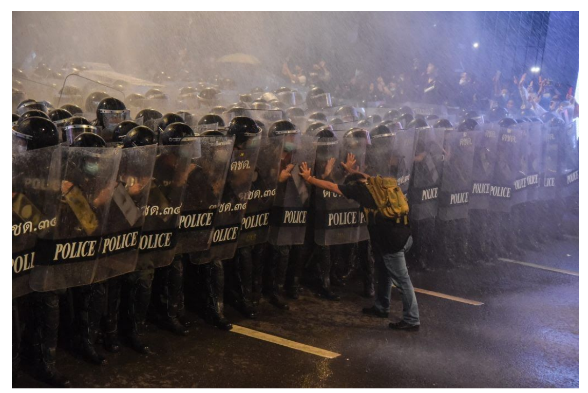
A protester tries to stop riot police from dispersing the crowd during the a pro-democracy demonstration at Bangkok's Pathumwan Intersection.