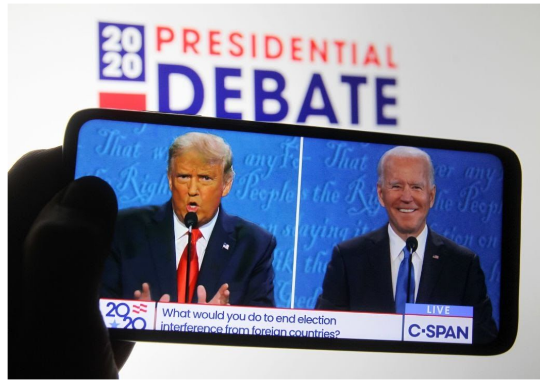
US President Donald Trump and Democratic presidential candidate and former US Vice President Joe Biden are seen during the final presidential debate displayed on a screen of a smartphone.