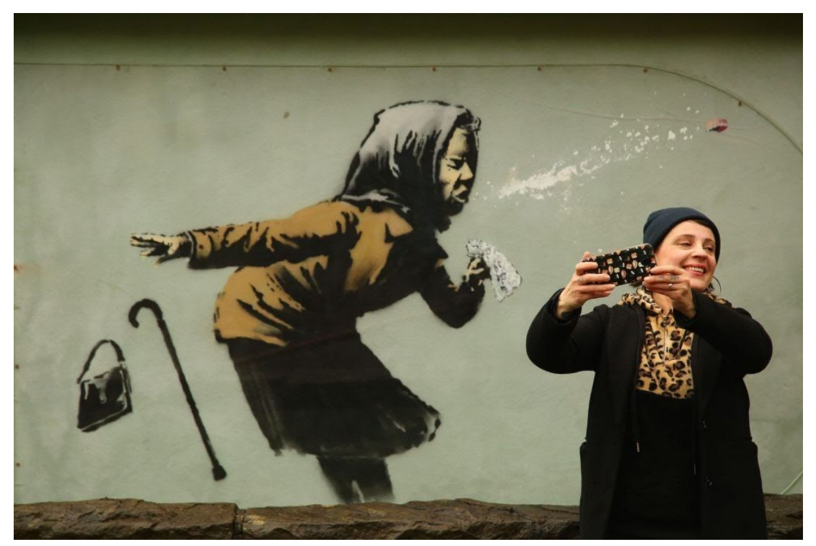
A person photographs a mural created by Banksy entitled "Aachoo!!" in Bristol.