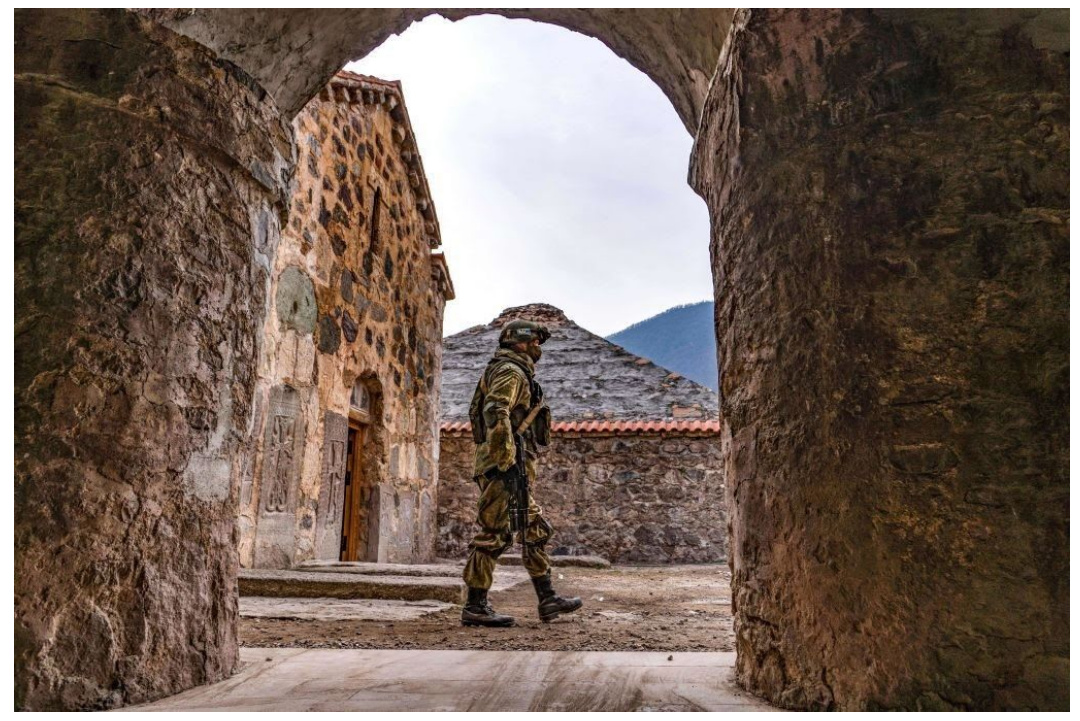
A Russian peacekeeper walks past along a yard of the 12th-13th century Dadivank Monastery, outside the town of Kalbajar on November 16, 2020, after the monastery was put under their protection as part of the peace agreement putting an end to the military conflict between Armenia and Azerbaijan over the breakaway region of Nagorno-Karabakh.