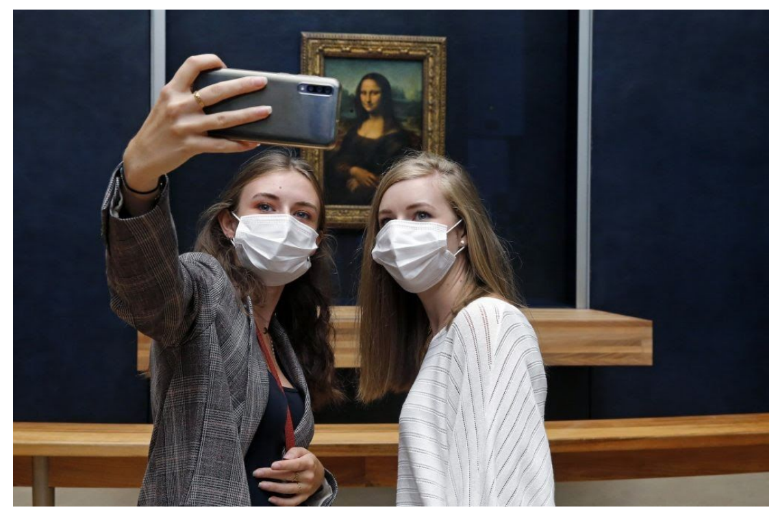
Visitors wearing face masks take a selfie with the painting of "Mona Lisa" by Leonardo Da Vinci at the Louvre museum.