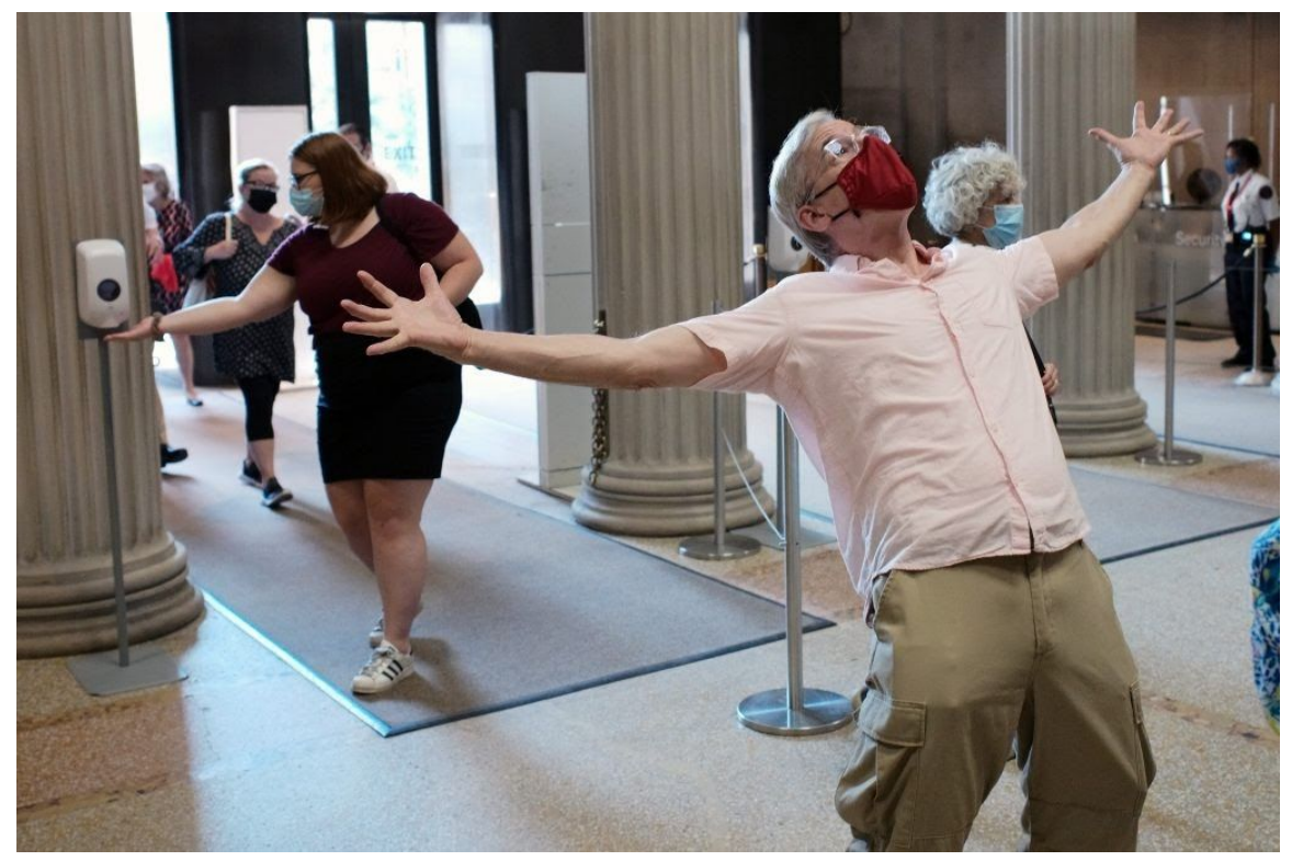
Welcome back! Visitors enter the newly reopened Metropolitan Museum of Art.