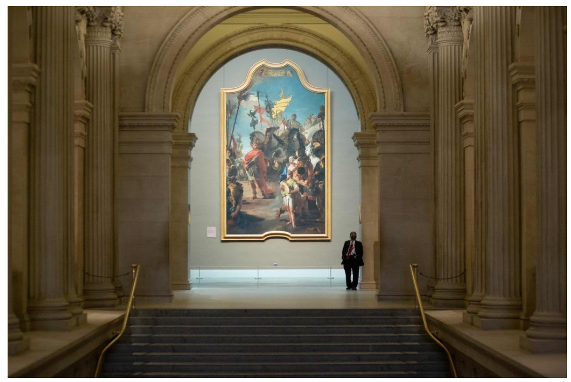
A security guard stands at his post at the uncharacteristically empty Metropolitan Museum of Art.