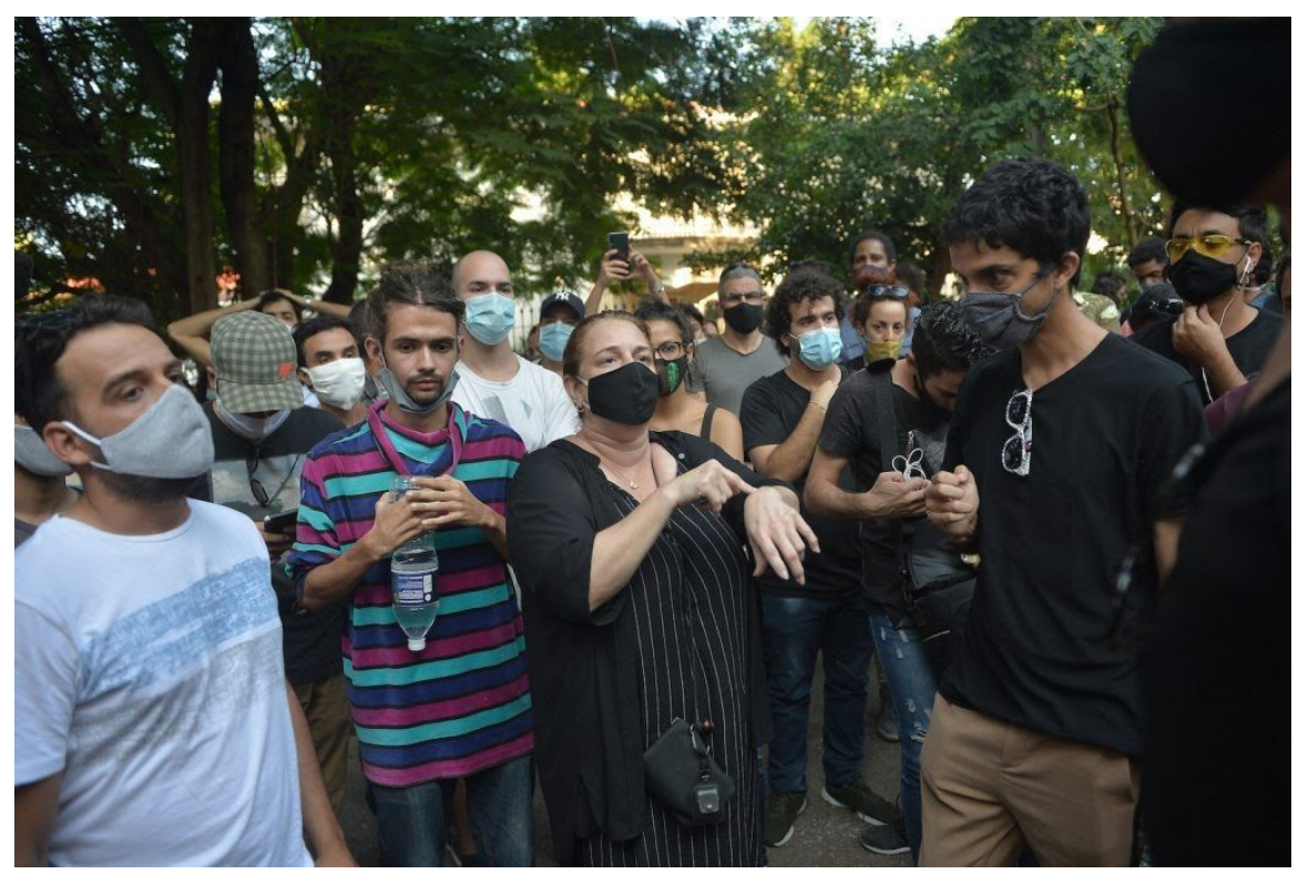
Tania Bruguera speaks with other artists gathered outside the Ministry of Culture in Havana on November 27, 2020.