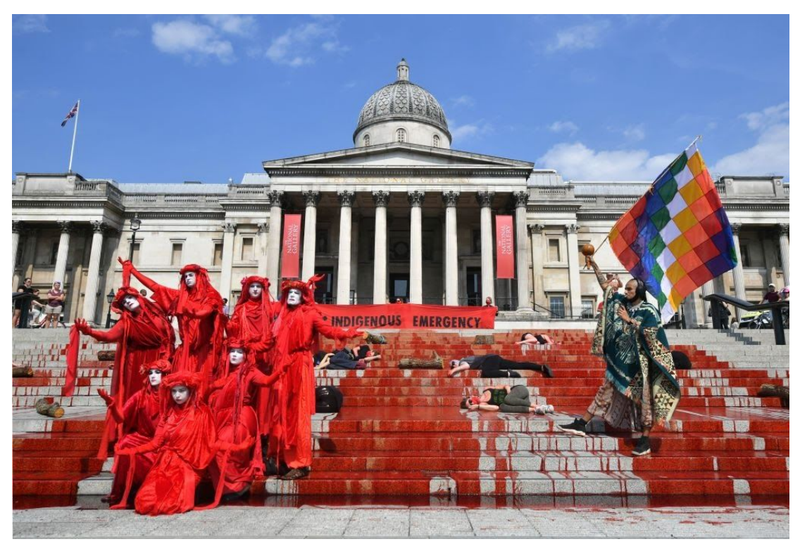
Extinction Rebellion pour dye down the steps near the National Gallery in Trafalgar Square, London, during a protest in solidarity with indigenous communities in Brazil who are dying from Covid-19.