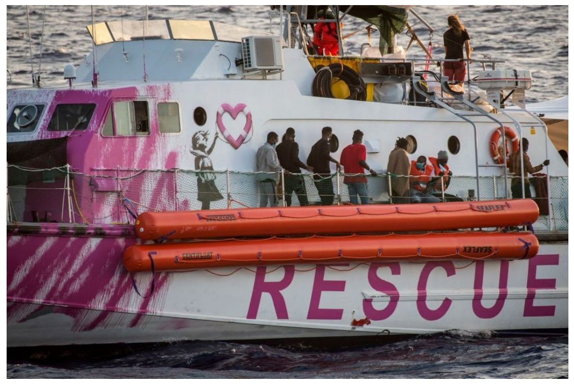
Migrants stand on the rescue ship funded by British street artist Banksy "Louise Michel" during a rescue operation by crew members of civil sea rescue ship Sea-Watch 4 off the coast of Malta, on August 29, 2020.