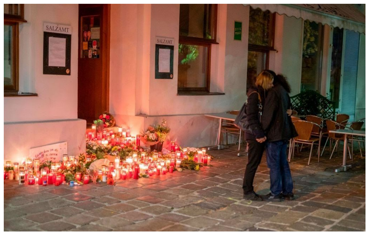
Mourners hugging in front of a restaurant that was the place of the terrorist attack in Vienna, Austria, on November 4, 2020.