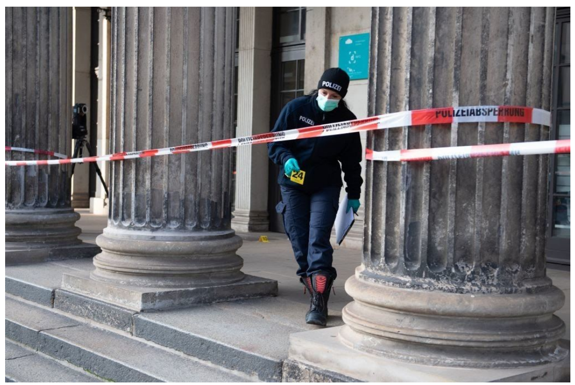
A policewoman walks through the crime scene of Dresden's Green Vault on Monday, November 25, 2019.