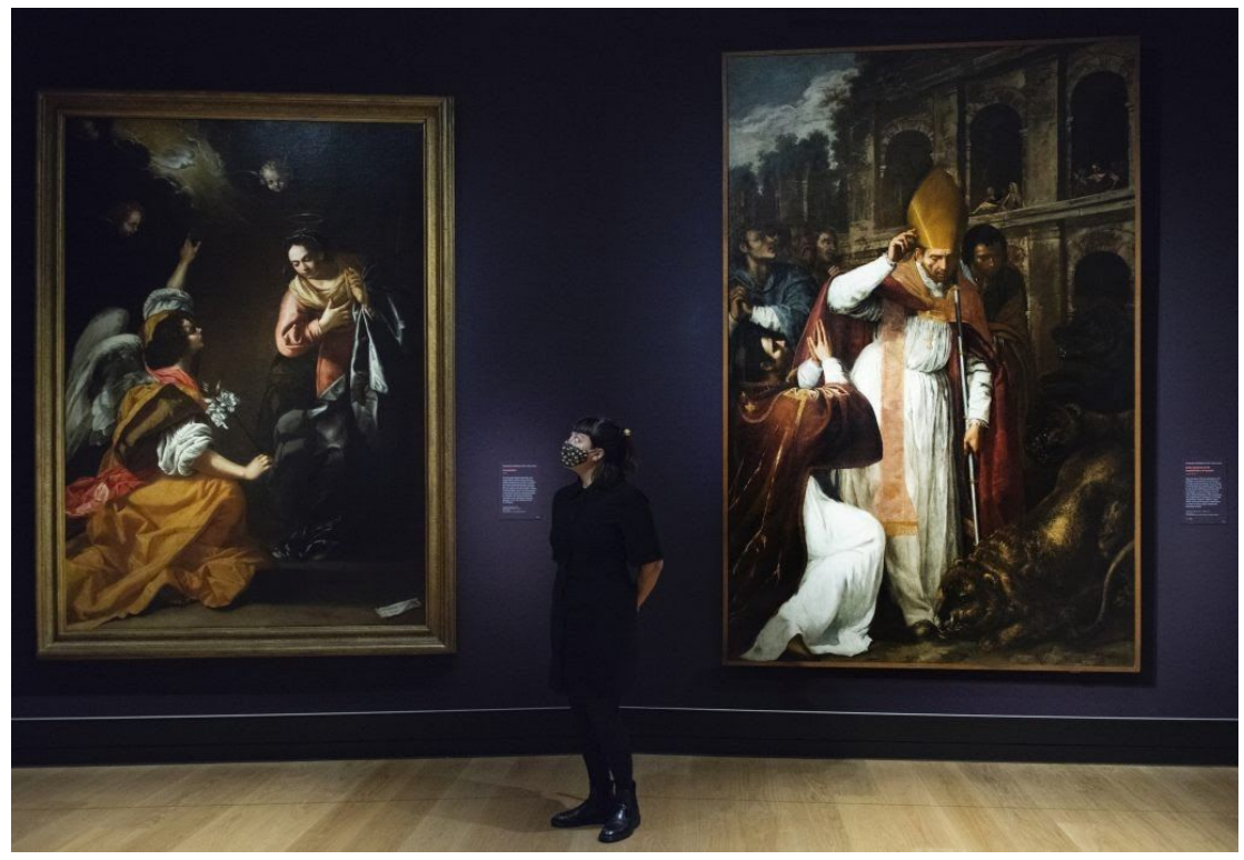
"Artemisia" at the National Gallery in London is the first-ever exhibition of the work of Artemisia Gentileschi.